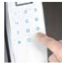
Touch pad design