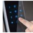
Touch pad design