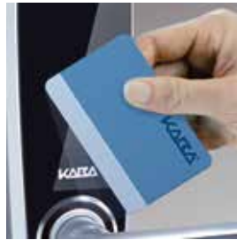
High security RFID card