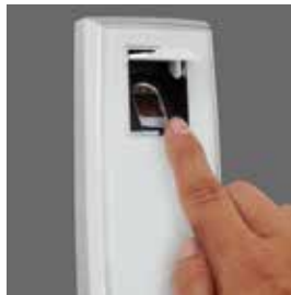
Reliable & Fast fingerprint sensor