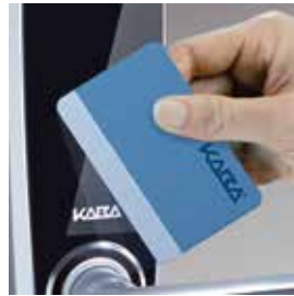
High security RFID card