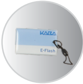
RFID Mobile Tags