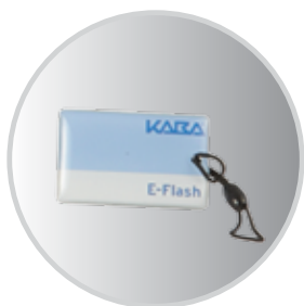
RFID Mobile Tags