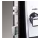
Secure and power save European lockcase