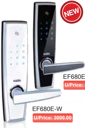
EF680E-B U/Price: 3000.00