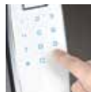
Touch pad design